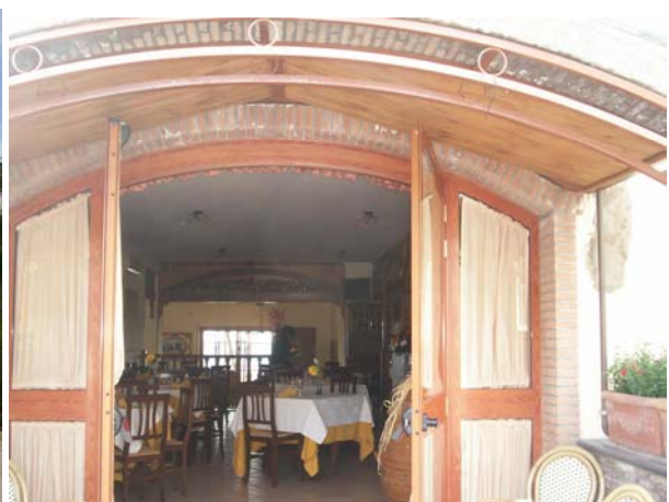
The front of the restaurant nearby