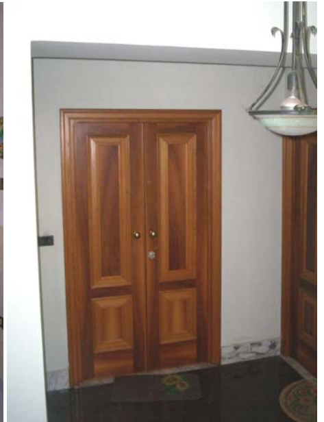
Internal finishes, doors, floors, tiles etc.