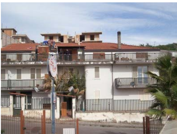
The front of the apartments