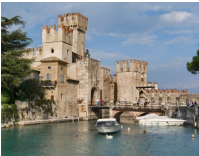
Views around Lake Garda