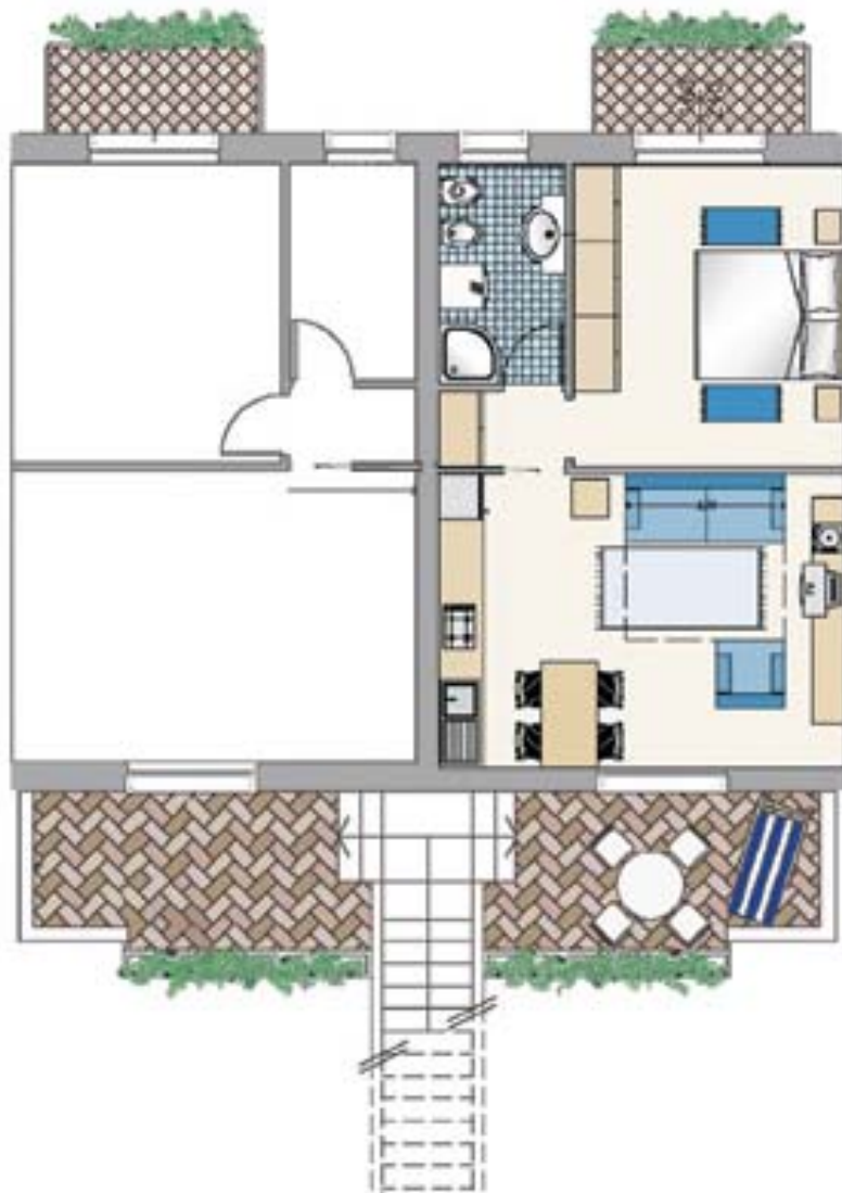
Top floor 1 bedroom apartment layout