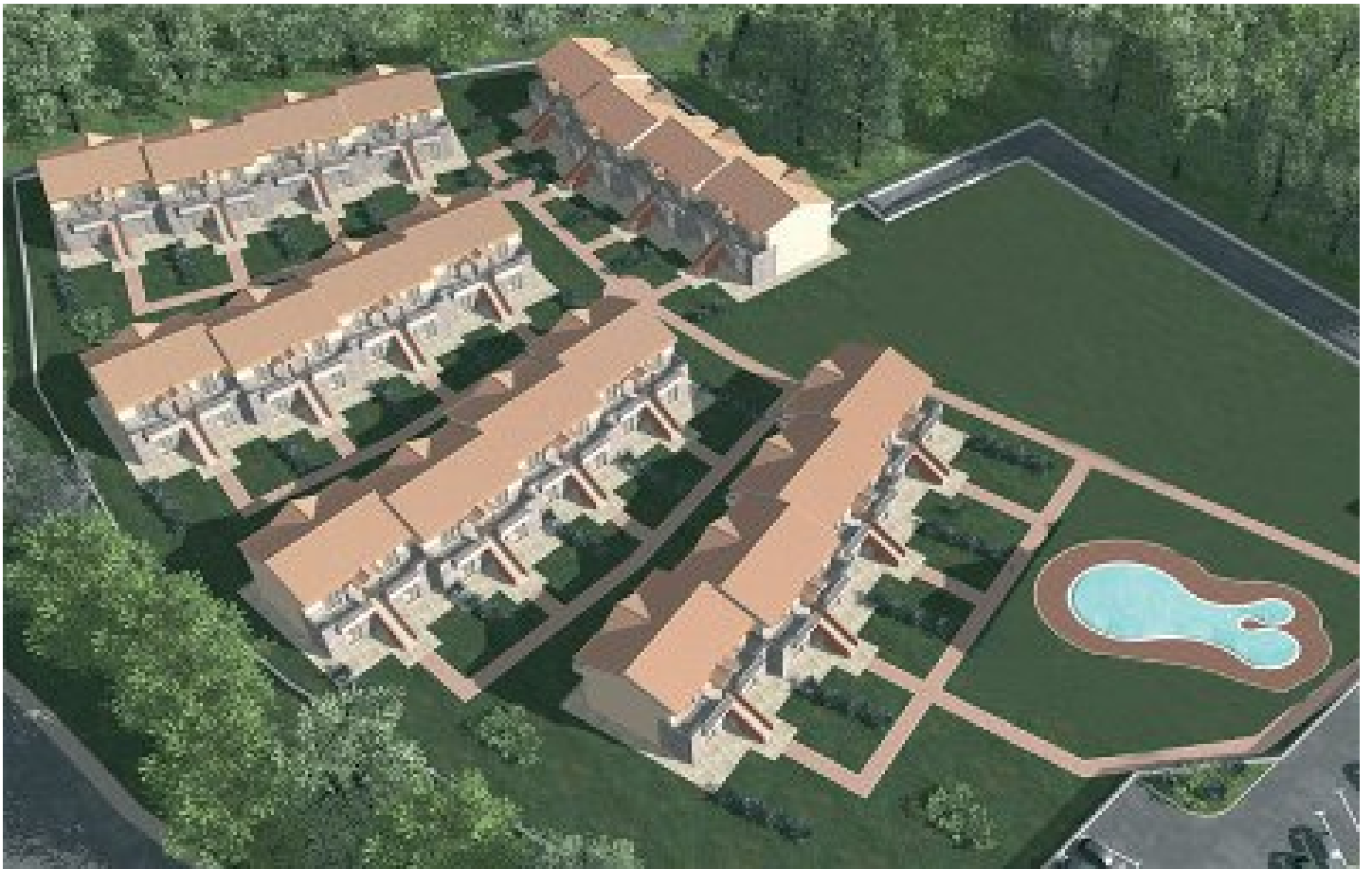
Aerial view of the development