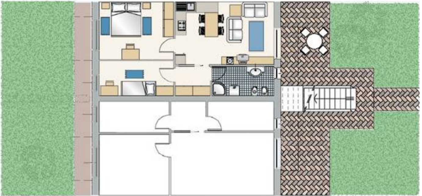
Ground floor 2 bedroom apartment layout